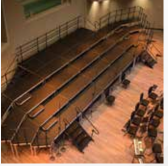
STAGETEK® STAGING SYSTEM